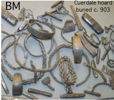
Cuerdale hoard buried c. 903

Looking at a picture of a piece online or in a book or seeing and photographing it in a museum may not give you all the information you want. One way of supplementing that is to look at similar pieces that are broken, such as hacksilver in a Norse hoard or an Anglo-Saxon false cloisonné piece with the garnet missing. Another is by combining the information you get by looking at one piece with additional