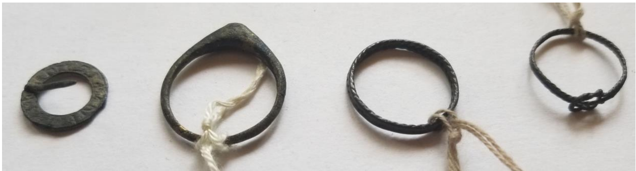
Figure 1: Simple Period Pieces I Own

There are at least five ways of getting the relevant information. The best and least common is to actually examine the jewel you plan to base yours on. It is possible to buy simple period pieces such as the ones in Figure 1. All of those were, I think, purchased in London at prices ranging from £23 to £90. Master Gaukler sells simple period jewels at Pennsic and online and there are other online sources, including eBay. Pieces you can buy at a reasonable price are likely to be, like those shown, simple ones made of base metal or perhaps silver — but simple, inexpensive, period pieces are at least as useful in the Society as elaborate expensive pieces, even if less impressive. The double-twist ring shown one from the right below is the model for the rings I give as tokens to people who camp with us in the Enchanted Ground.