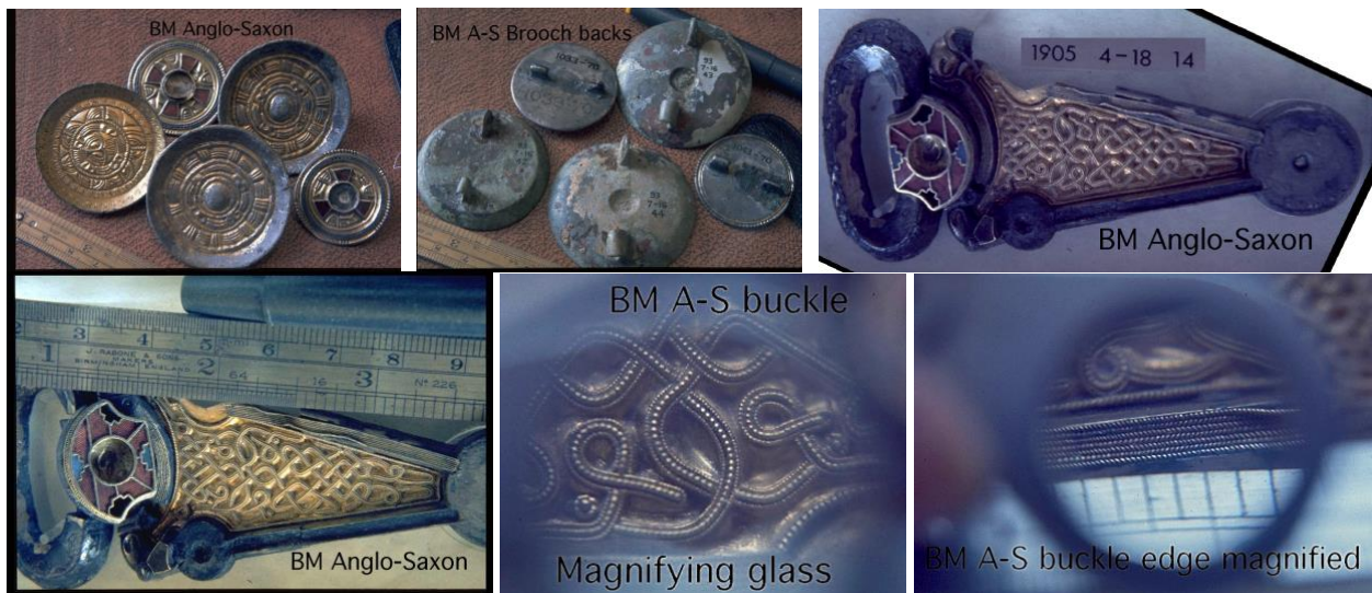
Figure 2: BM pictures